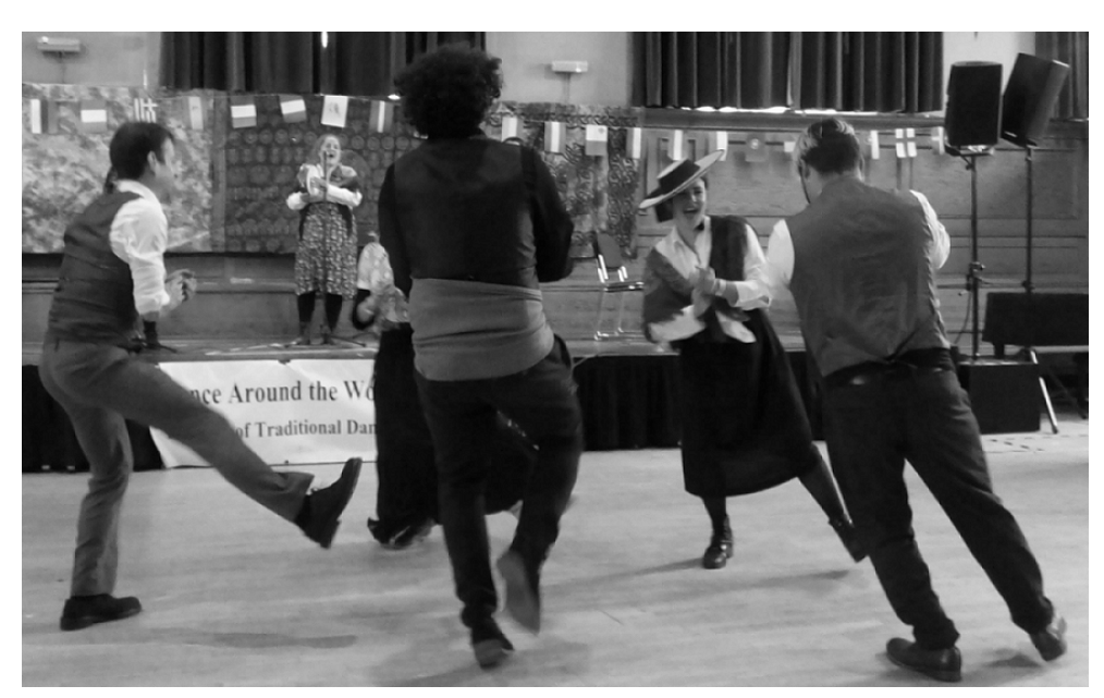
high energy Spanish dancers from Galicia

Events covered by SIFD insurance are marked S.I. Please remember that the onus is on <u>you</u> to mark each event when sending in the notice if your event is covered by our insurance.