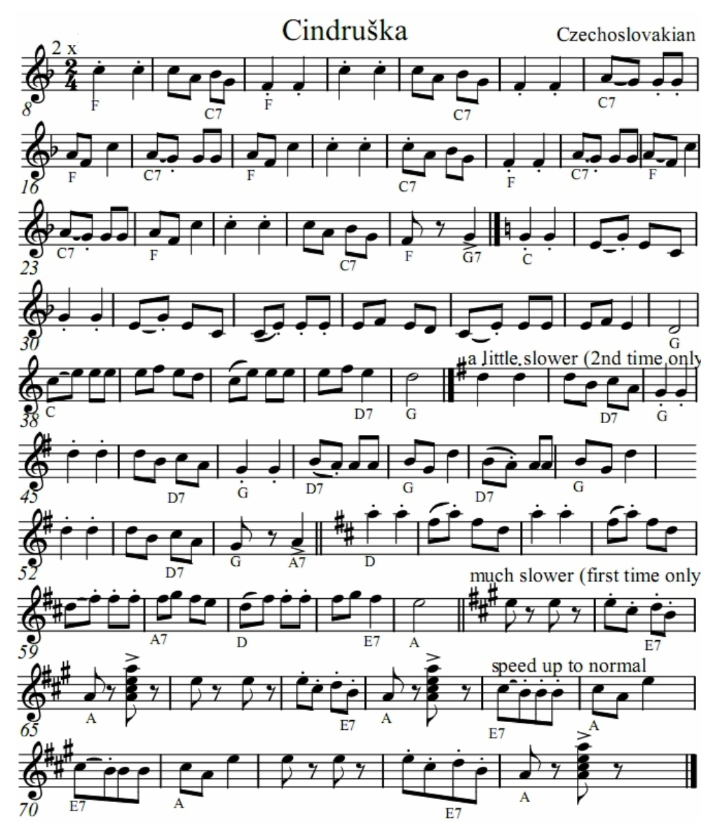
"Wilf Horrocks' Collection"