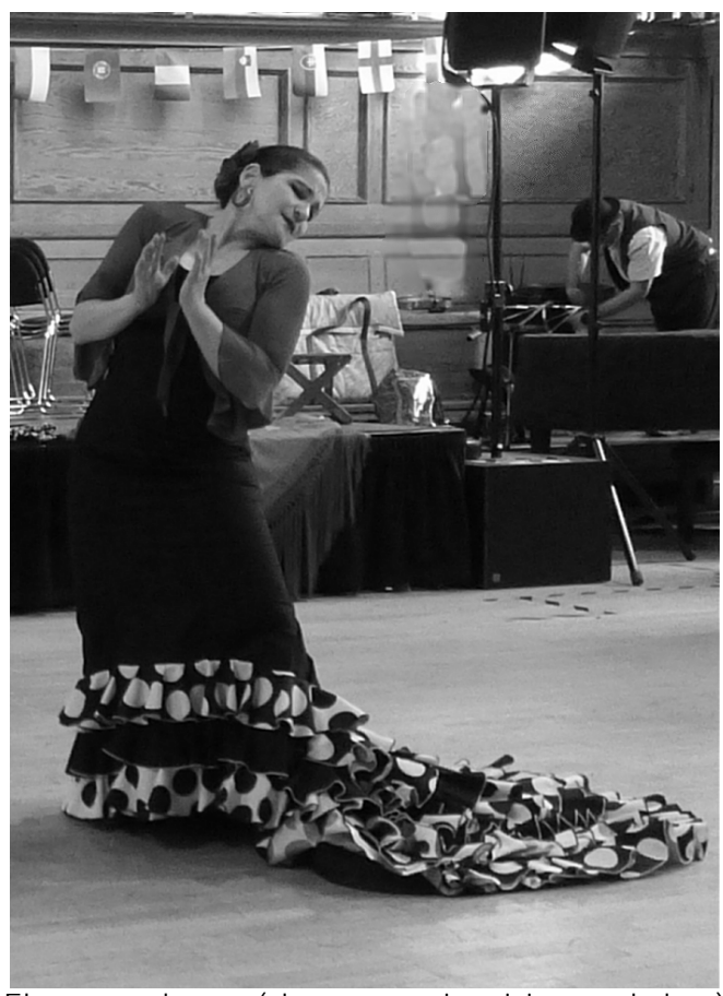
Flamenco dancer (she gave an inspiring workshop)